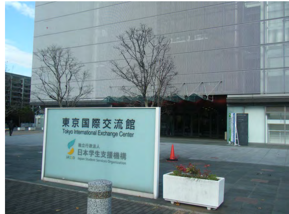
Tokyo International Exchange Center