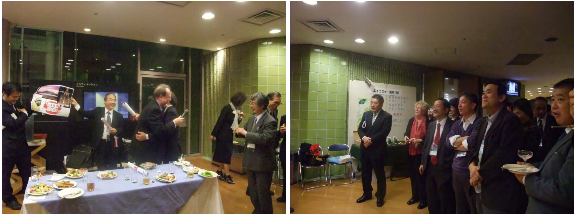
Social Evening with German beers and food