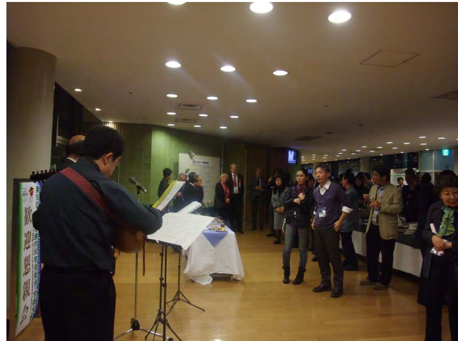
Social Evening with German beers, food and music