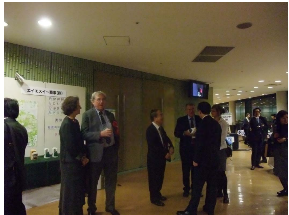
Social Evening with German beers and food