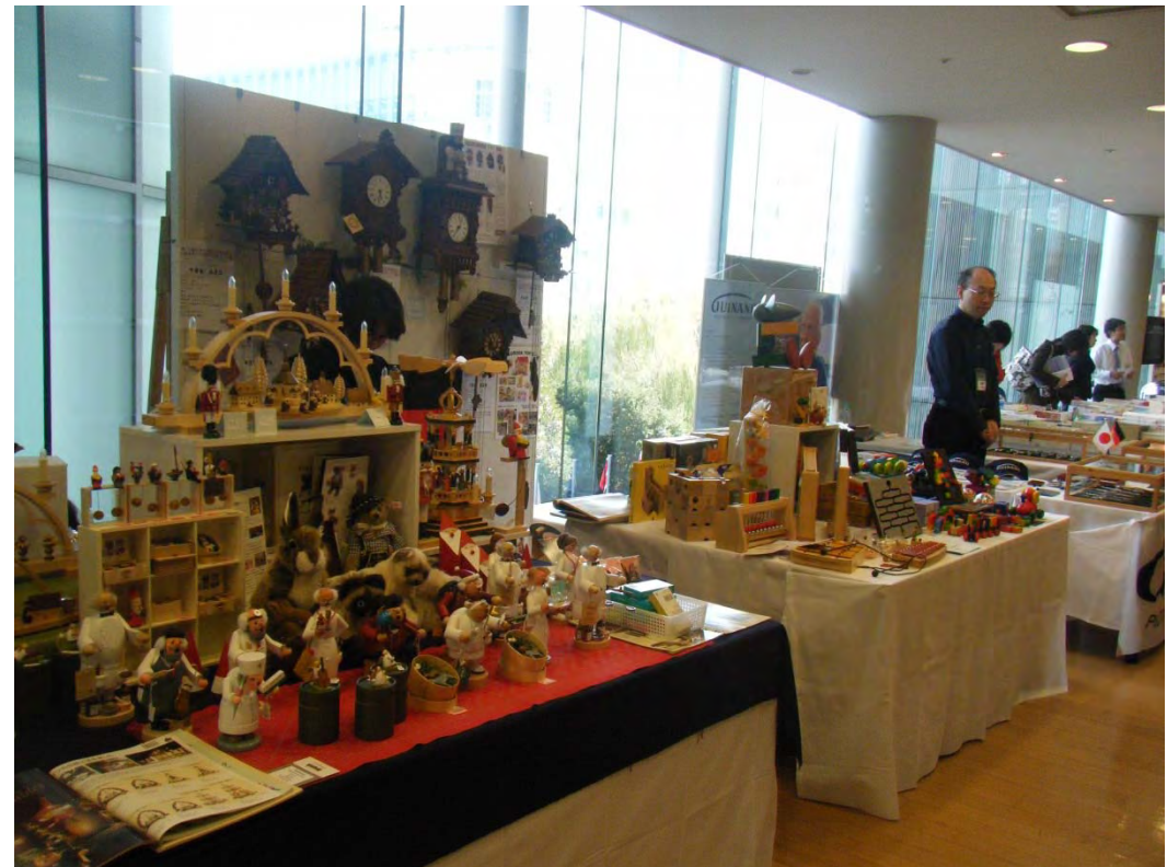
German Exhibition with clocks and toys