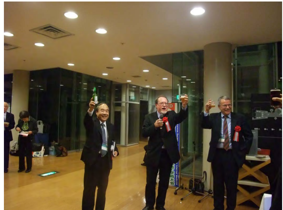
Social Evening with German beers and food. Toast !.