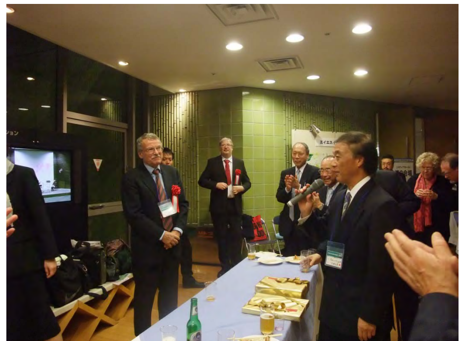
Social Evening with German beers and food.