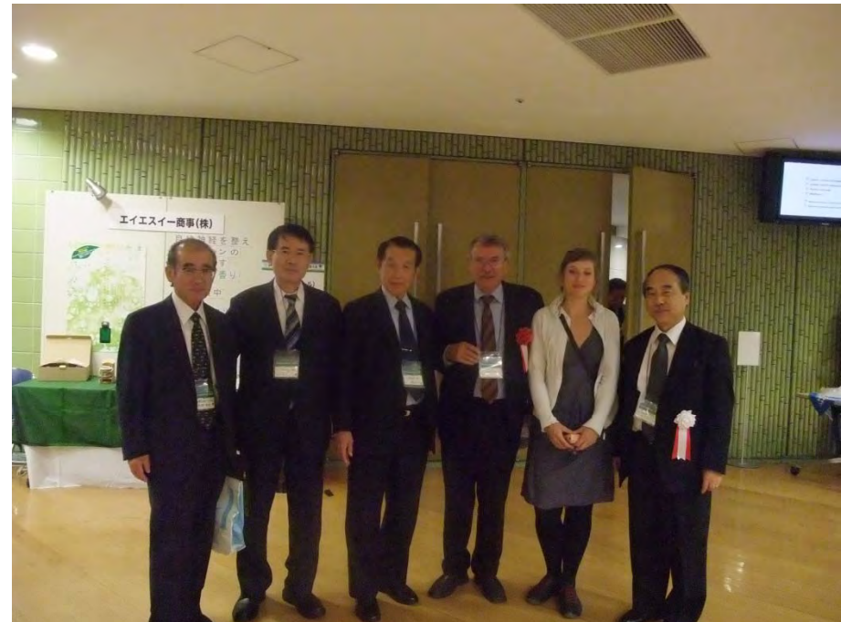
Social Evening with German beers and food