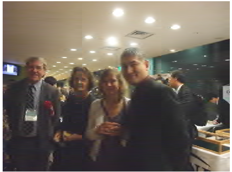
Social Evening with German beers and food